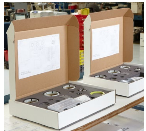
Dedicated Kit Staging and Storage Area