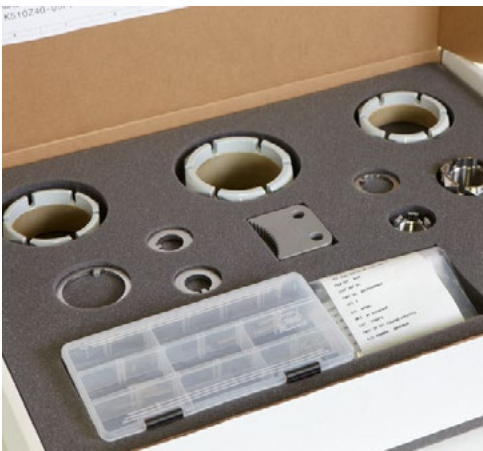
Custom Shadow Box Kits